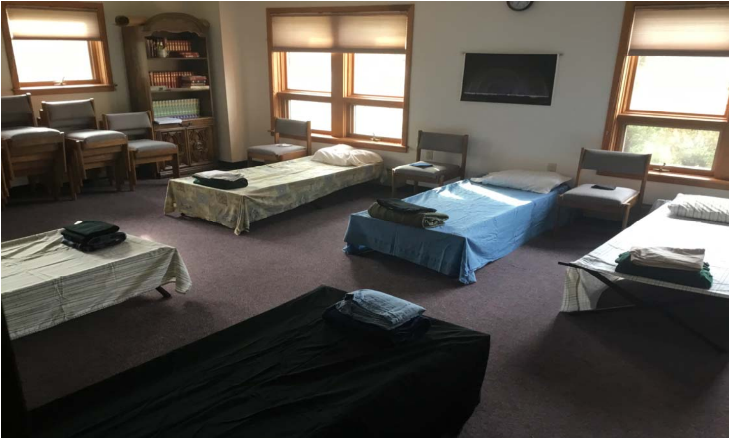
Ready for our guests! Our staff and church volunteers make sure the incoming guests are as comfortable as possible by setting up the cots and tables for dinner.